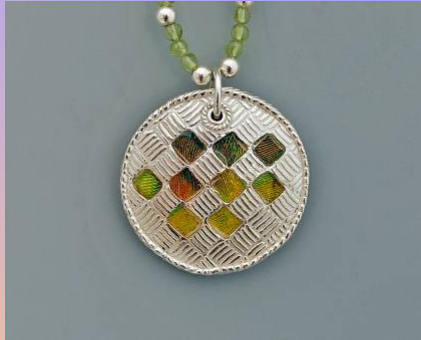
“Macaw Circle Pendant”