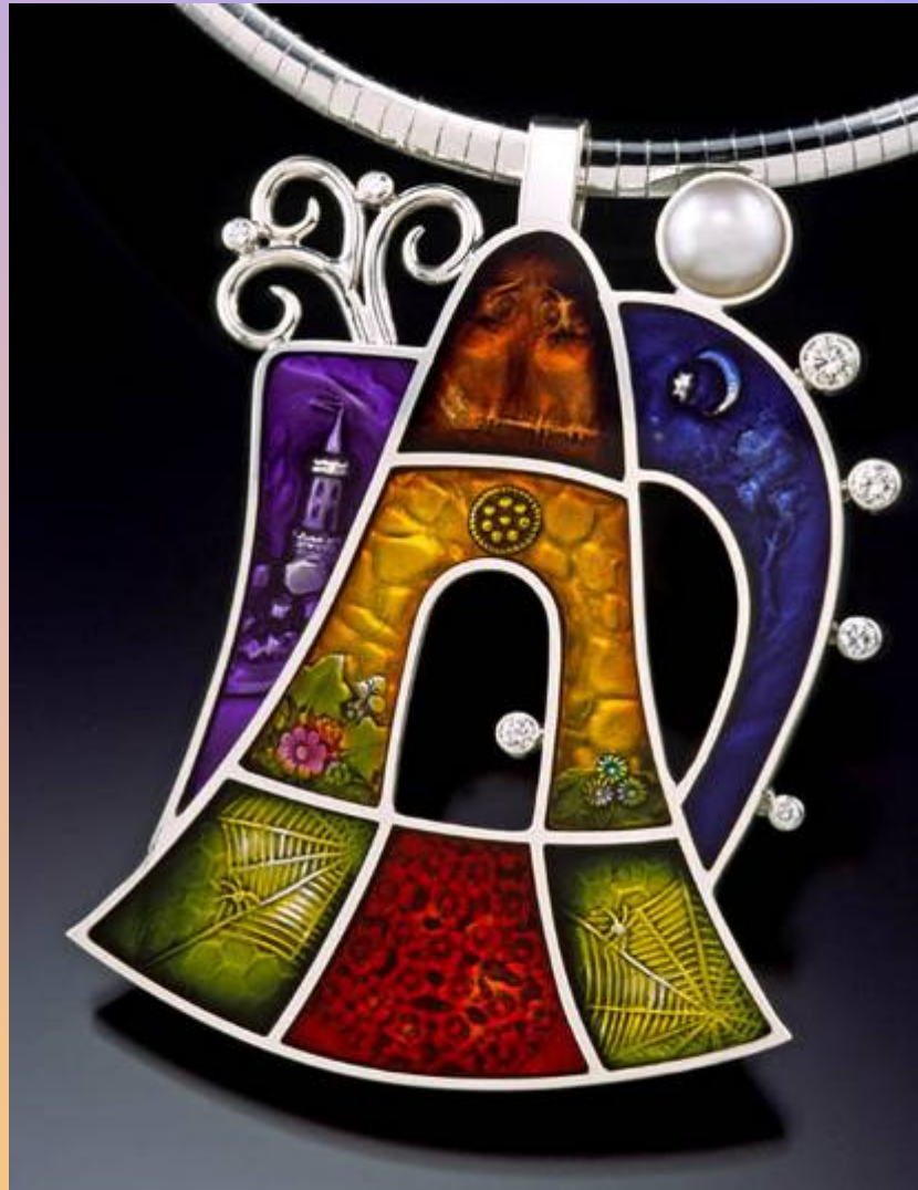
“Rowling Cottage” Ivy Solomon