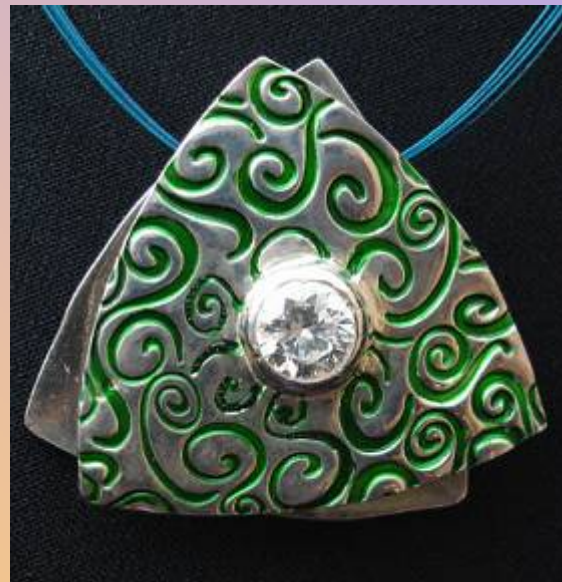
“2 for 1 Pendant” Judi Weers