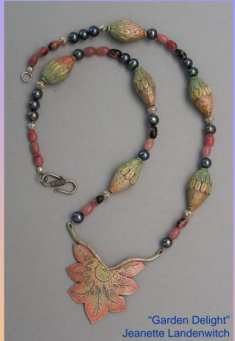
"Garden Delight" Jeanette Landenwitch