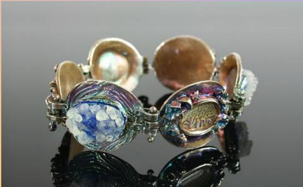
“Under the Sea”