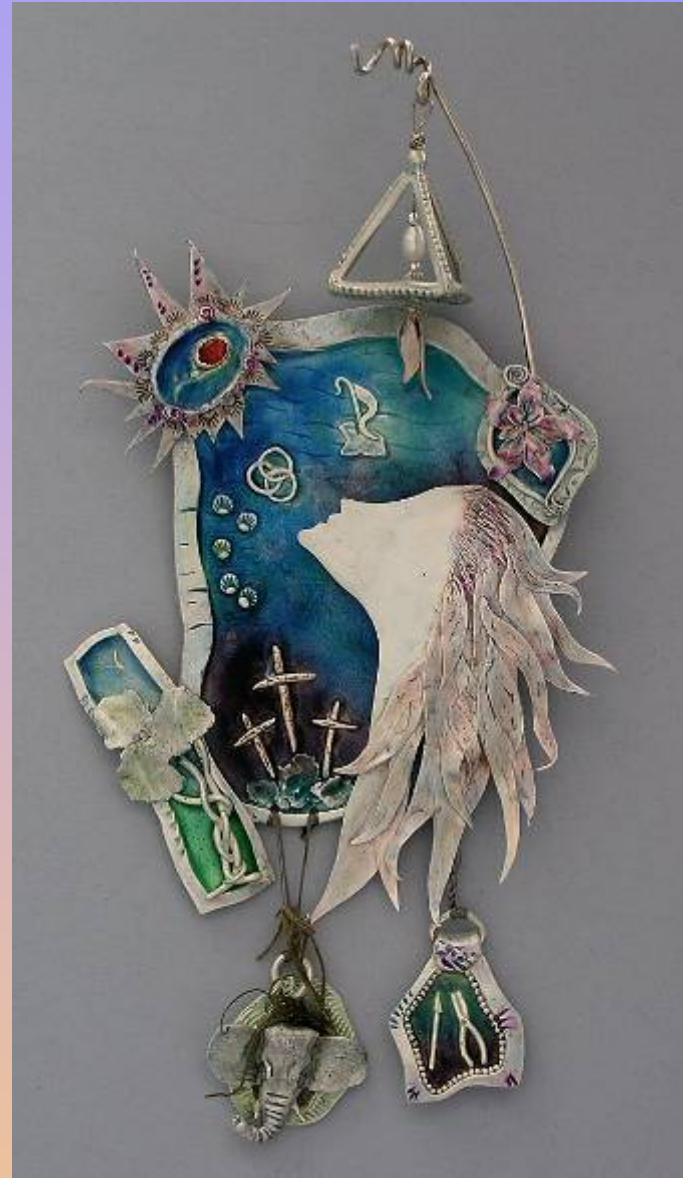
“Windows to My Soul”