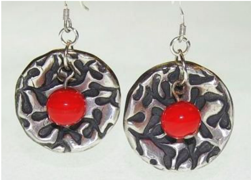
At left, the front of the earrings. Below, great texture on the back, too!